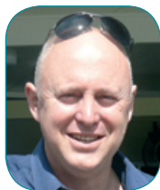
Local Communities Lead The Way Carbon Townsville

The west has been living with Climate Change for longer than easterners and have made drought-proofing methods.